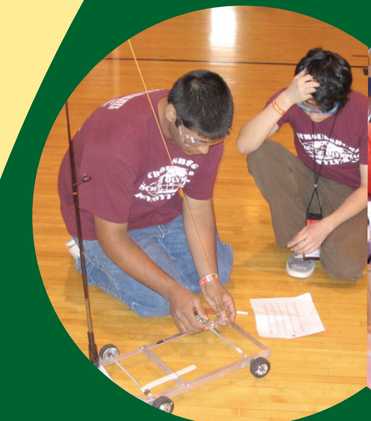
A team of two calibrates their Wheeled Vehicle on-site to travel between 5 and 10 meters and stop at a finish distance revealed only at the start of the competition.

Students show their creativity and Missouri state pride with a tribute to President Harry S. Truman's famous catchphrase at the 2006 Science Olympiad National Tournament Opening Ceremony at Indiana University.