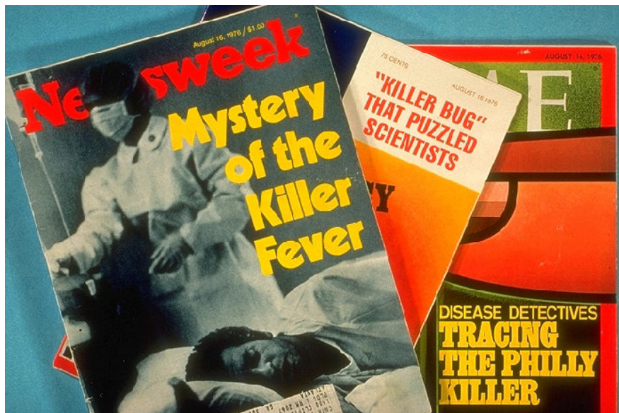
Fig 1. Covers from Magazines Featuring Articles on the Outbreak of Legionnaires Disease in Philadelphia, Summer 1976 (CDC Public Health Image Library)

The year 1976 marked the 200 th anniversary of the signing of the Declaration of Independence and the start of a new era in public health – the era of emerging infectious diseases. There was widespread concern about the isolation of a strain of influenza virus from a soldier who died from the disease in Fort Dix, New Jersey in early February. The virus was similar to that responsible for the great pandemic in 1918 and in March President Gerald Ford announced a $135 million plan to immunize Americans against the so-called “swine flu”. The health care and public health communities were on the alert for cases of severe respiratory illness that would suggest the start of a pandemic.