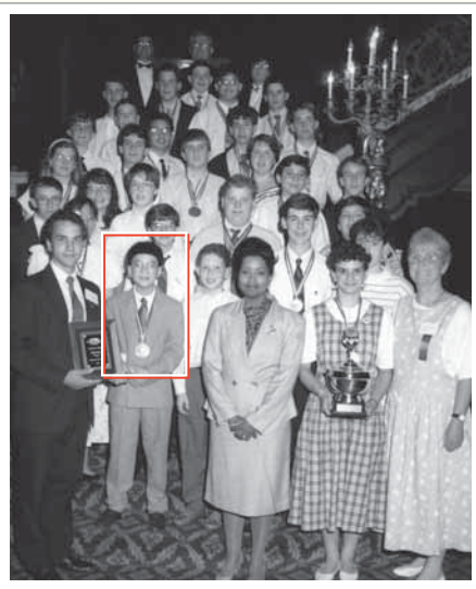
Members of the Pierce Middle School Science Olympiad team at the 1991 Science Olympiad National Tournament in Kansas City, Missouri.