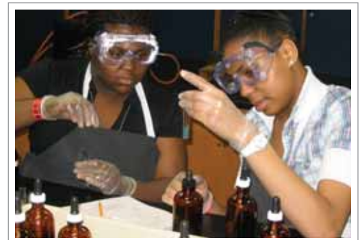
Chicago Public School students compete in the Chem Lab at the Wright Community College Science Olympiad Regional Tournament as part of the Urban Schools Initiative.

In 2006, the Science Olympiad Executive Board determined that increasing minority participation in Science Olympiad was one of the most important goals of the organization. With generous local grants and a strong consortium of partners, the Urban Schools Initiative was piloted in the Chicago Public Schools in 2007, providing teams with membership, materials and extensive training workshops for each of the school coaches. The program uses a three-year stepping-up progression of events and a protected regional concept to allow teams to advance to the state tournament while giving them the confidence to explore Science Olympiad events at a gradual pace.