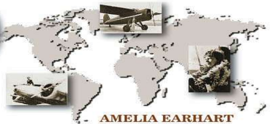
AMELIA EARHART 1897 - 1937