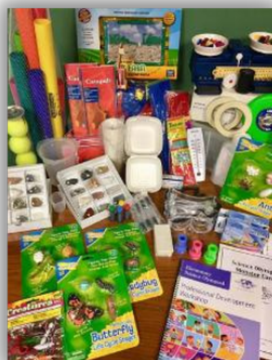
ELEMENTARY SCIENCE OLYMPIAD IN-A-BOX (PRICE: $320)*